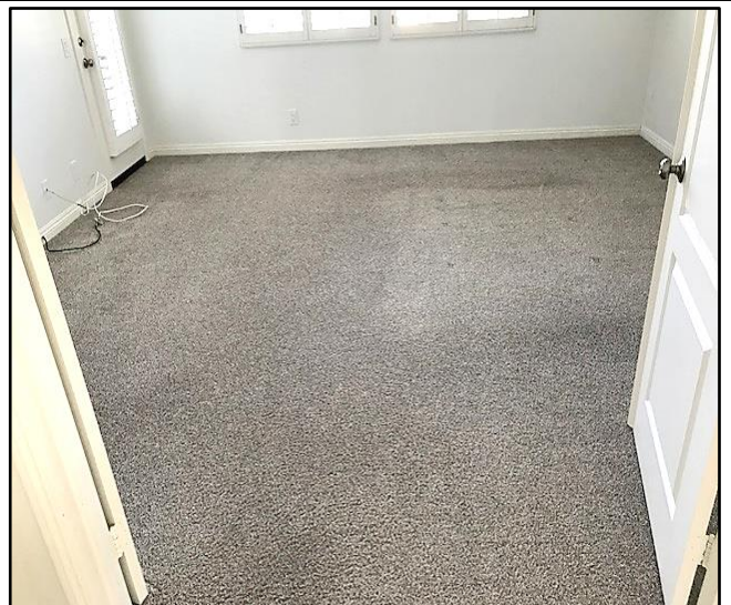
2. Deep tracked soils around where a bed used to be.