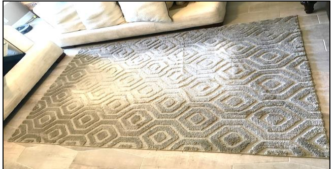
4. Extreme dog oils on a nylon area rug.