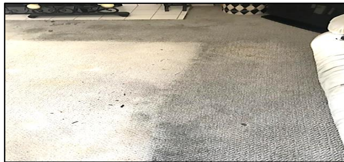
3. Extreme soil in olefin carpet & shows where area rug was.