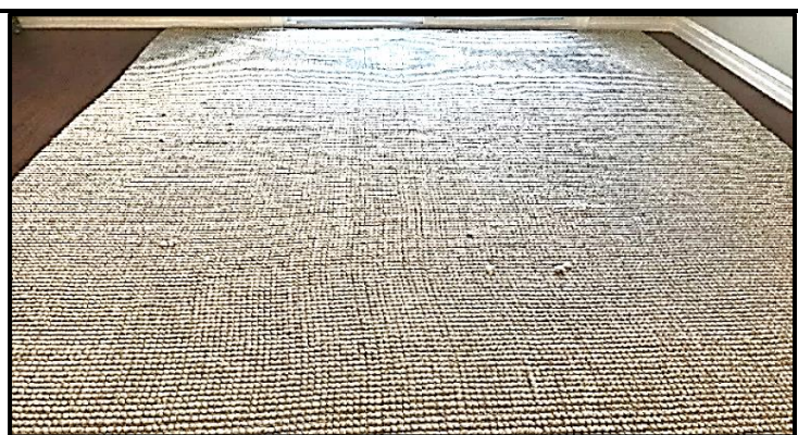
Wool and viscose (rayon) blend area rug. It is popular.