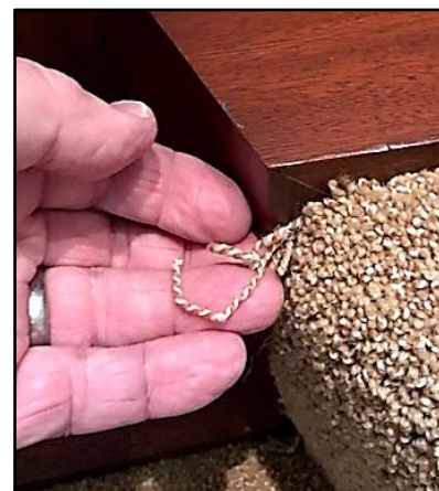
Two yarns in one!