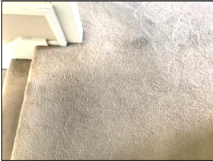
1. Sharp turn in top of nylon hallway that leads to bedrooms.