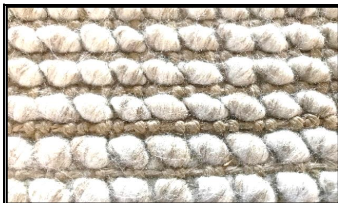
White loops are wool, small brown loops are jute.